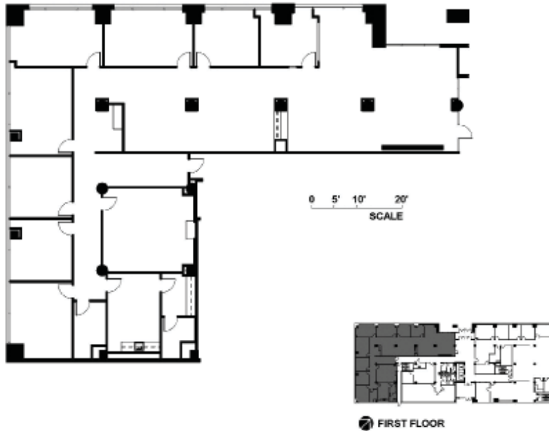
SUITE 300 | 3,001 RSF.